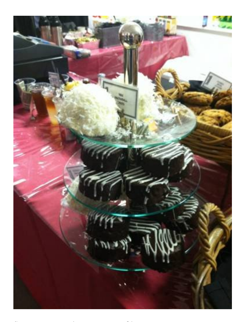
Sweet <u>treats</u> at the gourmet café.