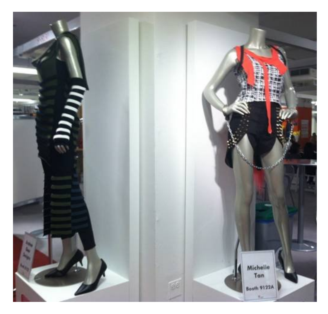
Mannequins lead the way to the designer's booths.