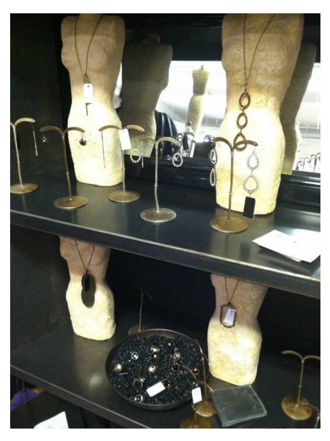
New York based Rebel Designs has unique pieces that would look amazing on anyone.